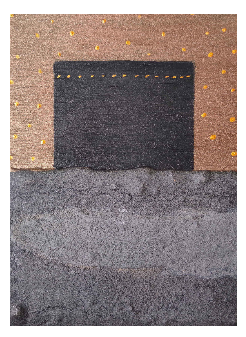
Abul Hisham Memory I, 2022 Mixed media on wood 16 x 9 cm 6 38/127 x 3 69/127 in AbHi020