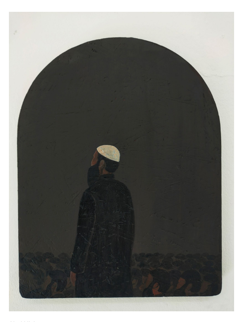
Abul Hisham Stand up, 2022 Acrylic on wood 38.50 x 30 cm AbHi005