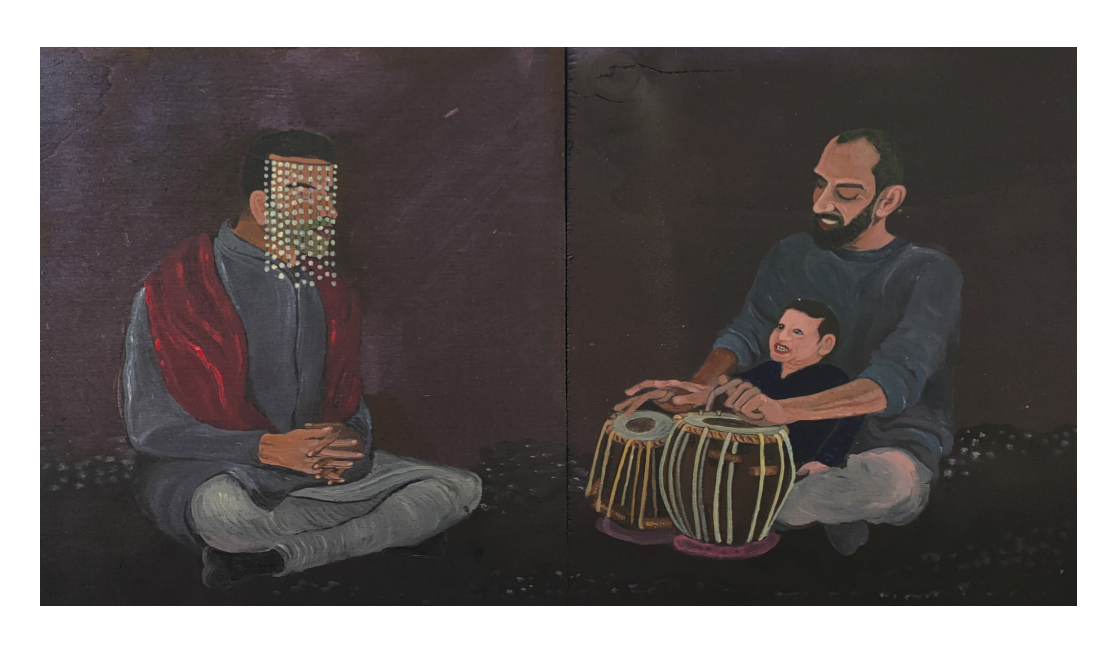
Abul Hisham Your history is my history, 2021 Acrylic on wood 21 x 40 cm 8 34/127 x 15 95/127 in AbHi019