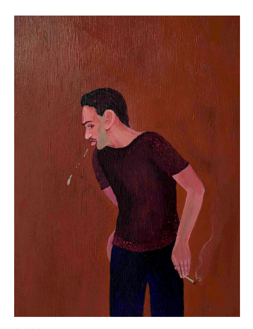
Abul Hisham Spitting man, 2022 Acrylic on wood 30.50 x 20 cm AbHi004