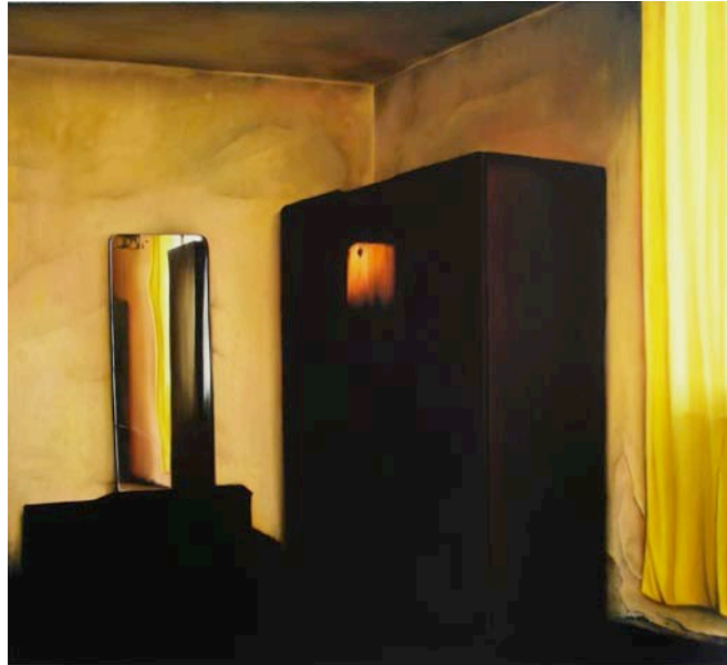
Grandpa's House , oil on canvas, 2008

Marc Jancou Contemporary is pleased to announce the opening of the exhibition Night After Night . This will be Slawomir Elsner's first solo show in New York.