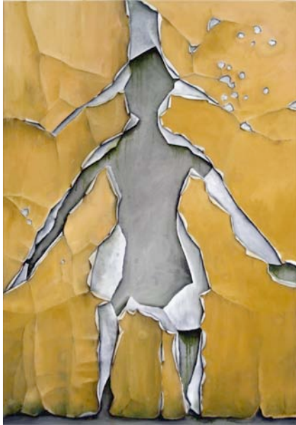
Cien , oil on canvas, 2008

Opening Reception and Book Signing: Thursday, May 29, 6-8 pm