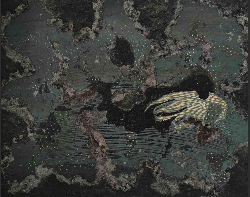
Abul Hisham Creepy dog , 2021 Acrylic & paper mache on board 30hx 24 cm 11 73/90 x 9 57/127 in AbHi018