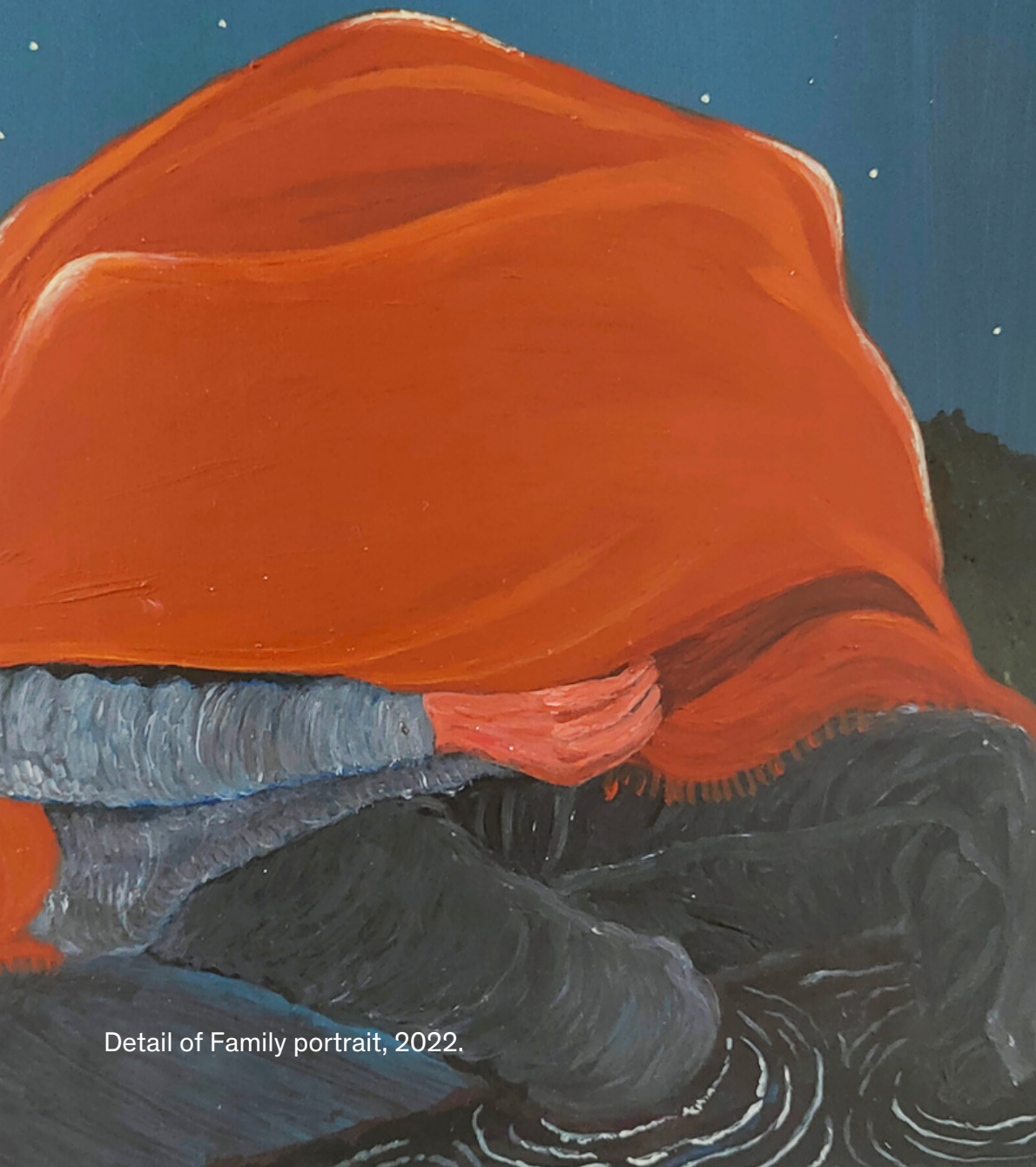
Detail of Family portrait, 2022.

"Projecting aspects of his own interiority onto the visages and gestures of the real people he encounters—those he perceives as often overlooked or invisible—Hisham's studies of them are endowed with humanity and elegance in the face of the struggles they are presented with"