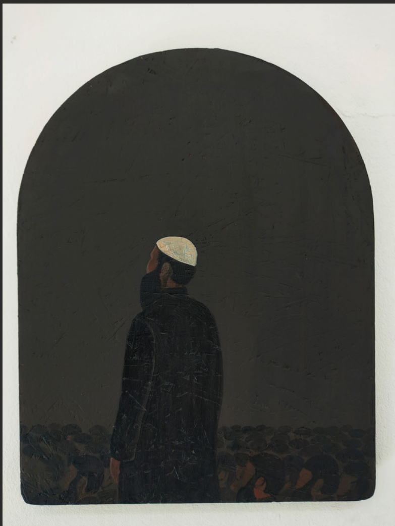
Abul Hisham Stand up , 2022 Acrylic on wood 38.50 x 30 cm AbHi005