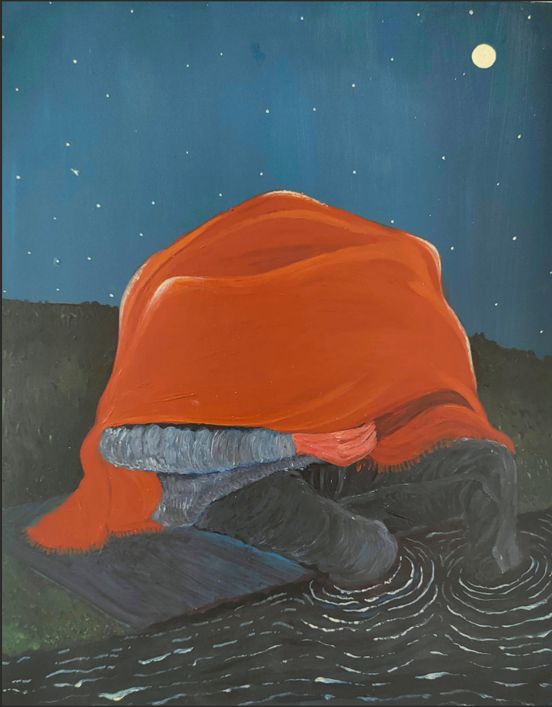
Abul Hisham Family portrait , 2022 Acrylic on board 30 x 24 cm AbHi006