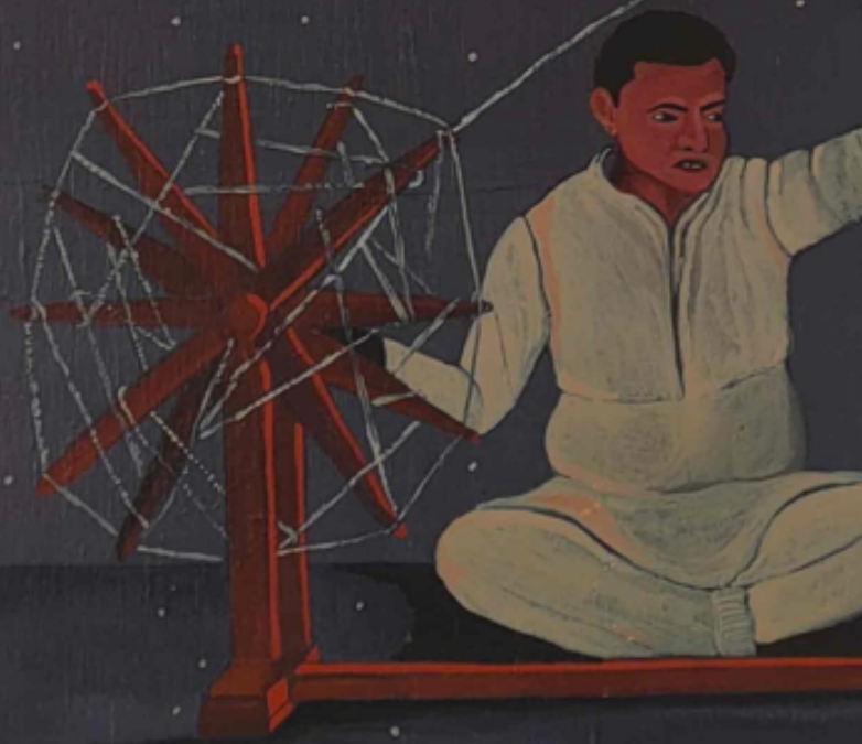
Detail of Entangled spinning wheel, 2022

"Entangled Spinning Wheel poignantly captures nearly the entirety of the artist's concerns; here the Gandhian chakra (spinning wheel)—which became the symbol of resistance against colonial rule during the Independence movement in India and prompted mass boycott of British-made goods including textiles—is all tangled up in thread, not unlike the contemporary crises that mangle an erstwhile secular imagination of the nation state. "