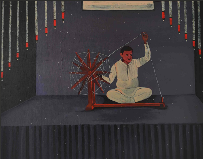
Abul Hisham Entangled spinning wheel , 2022 Acrylic on wood 56 x 56 cm + 21 x 23 cm AbHi012